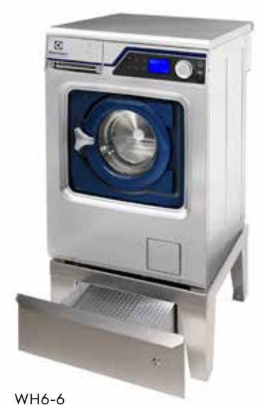
Base with removable lint collector