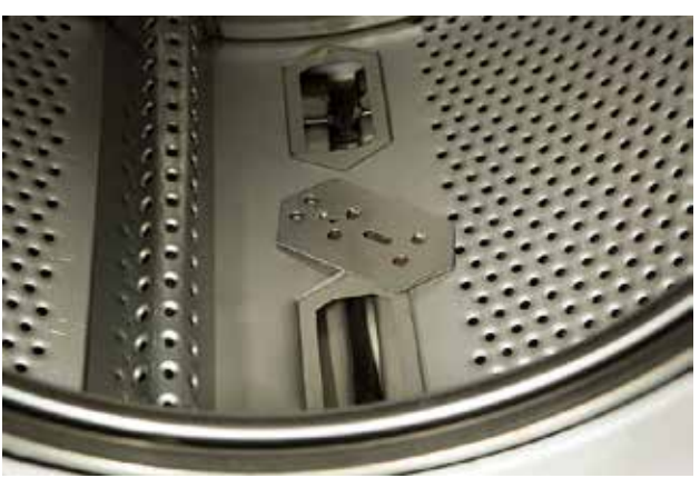
Lids in inner drum for easy cleaning

Art. No. 438908745EN/2021.04.21 We reserve the right to alter specifications without notice.